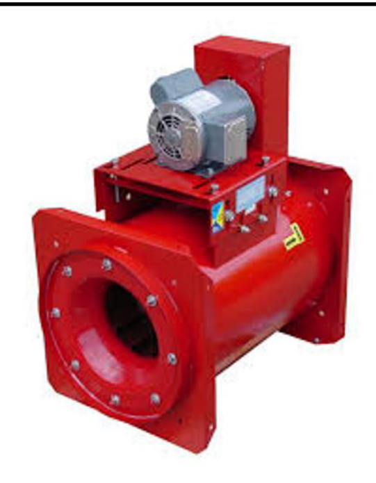
Coated exhaust fan

It was a call from a general contractor who had followed the architectural package that did not include any HVAC or plumbing drawings. Not until the end of construction did the owner decide to add a repair pit measuring 40 inches wide, 35 feet long, and 4 feet deep to allow his workers to easily access the underside of 18 wheeler diesel trucks. The pit was equipped with two 4 inch conduits for the compressed air and lubrication lines. When the county building officials arrived to review the final construction, the new repair pit was observed.