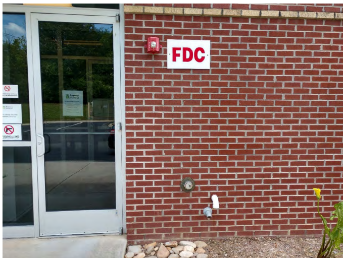
Fire Department Connection (FDC) sign Knoxville, TN