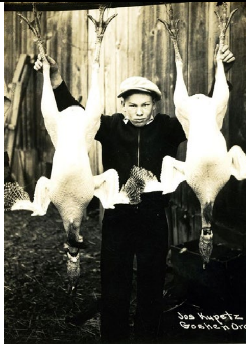
"That spec is a real turkey!"

Fortunately, a few entrepreneurial people, and later, manufacturers themselves, saw an unfulfilled need and began to produce master guide specifications for a great variety of construction products and systems. Unfortunately, the results typically have not followed the rules established by AIA and CSI documents. Even