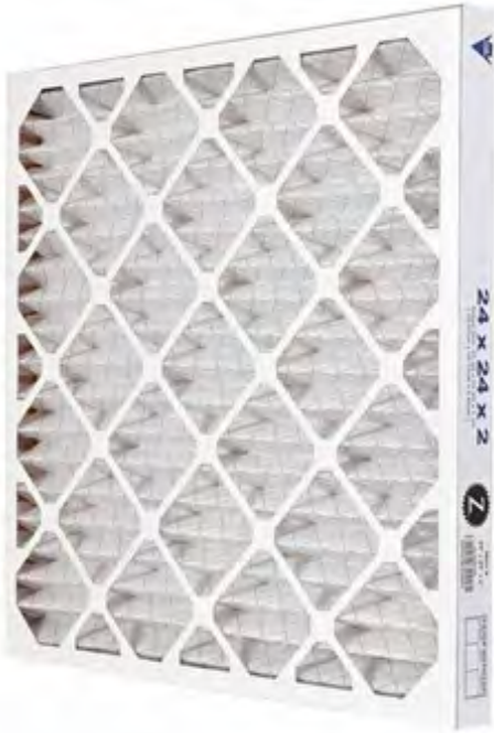
Standard 2" thick MERV 8 air filter

https://www.zoro.com/zoro-std-cap-pleated-filter-24x24x2-merv8-g7470876/i/G7470876/