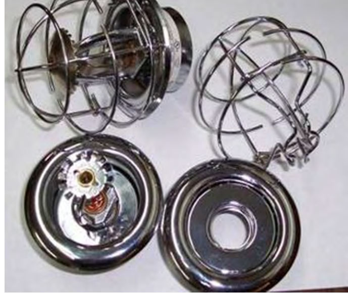
Sprinkler Head Cages

The classification of hazard determines the sprinkler head type and coverage and/or spacing between the heads. Depending on the classification and the space being served, the frangible bulb in the sprinkler