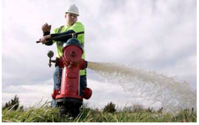
Fire Hydrant Flow Test

inside the building. If there is not enough water flow or pressure a fire pump and a fire water storage tank will be required. The calculations include the most remote 1,500 square feet of sprinklers flowing, the inside hose streams from standpipes and outside hose stream used by the fire personnel along with the friction and pressure loss as the water flows through the piping to the most remote area in the building. In the state of Tennessee the State fire Marshal's Office (SFMO) maintains a sprinkler design intent checklist https://www.tn.gov/content/dam/tn/commerce/documents/fire_ prevention/posts/FireCodesSprinklerDesignIntentNFPA13.pdf for mechanical engineers to design the system. This <u>11-page</u> checklist is broken down into several areas. If you want to learn more about this and other building