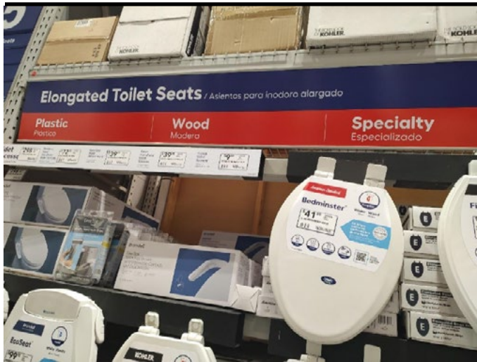
ELONGATED TOILET SEATS

vertical and horizontal makes the custodians job easier. Commercial toilet seats also feature integral bumpers on the underside of the seat instead of the separate bumper you often see in residential fixtures. The integral bumper is easier to clean since there are virtually no crevices between the bumper and the underside of the seat. Some of us may remember the old black toilet seats that were common in our elementary school. I'm not sure who thought of installing a black toilet seat on top of a white fixture but I'm sure the school custodians hated it. Another common residential toilet seat is one that's fabricated from stained and varnished wood. It is another unsanitary device which is difficult to clean well. Most residential toilet seats include a separate cover which makes it more difficult to drop a towel or other toiletry into the toilet. Many people are used to seeing elongated toilets in commercial buildings which are required by International Plumbing Code. Round front toilets are acceptable in residential use,