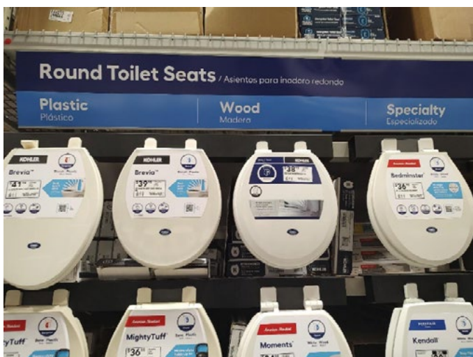
ROUND TOILET SEATS