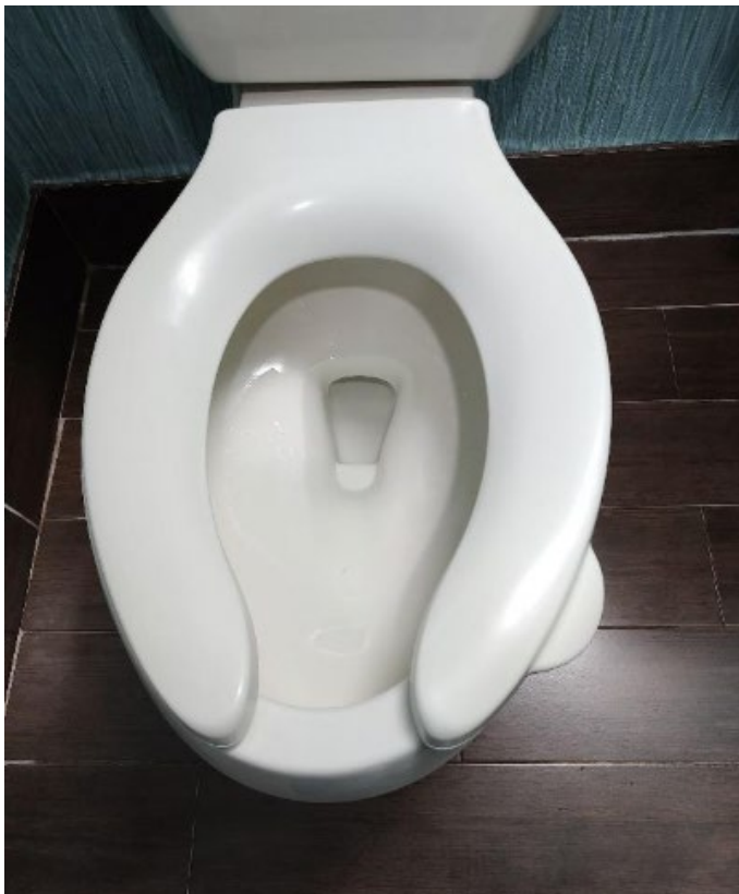
TOILET SEAT WITH AN EAR IN THE DOWN POSITION

toilet seats in healthcare and other type buildings. This feature allows someone to lift the toilet seat up with their toe instead of touching it with their bare hands or a piece of toilet paper. One of the other features of toilet seats is an antimicrobial chemical built into the toilet seat to reduce the spread of germs. There is also what's called a self-sustaining check hinge which keeps the toilet seat from slamming down. This check hinge allows the toilet seat to be held upright in almost any position between