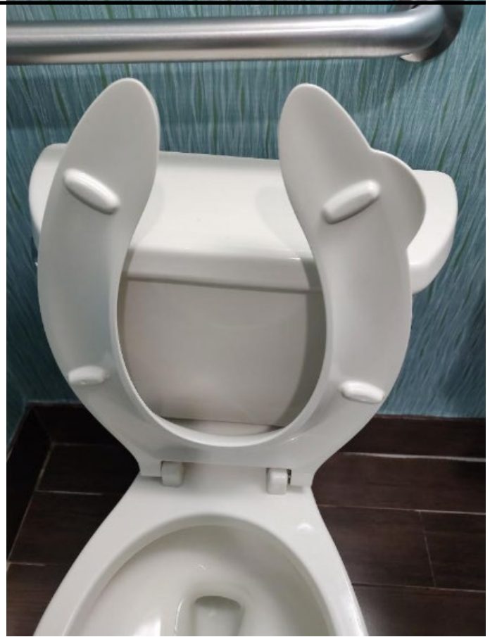
TOILET SEAT WITH AN EAR IN THE UP POSITION

What is that one usually white porcelain item that we all use at least two to three times a day? I know everyone thinks I'm obsessed with toilets or water closets, but it's not really true. But did you ever wonder about the number of features for a toilet seat? I stayed in a hotel recently where the public restroom toilet seats had an "ear" on the side of the toilet seat. We often specify these