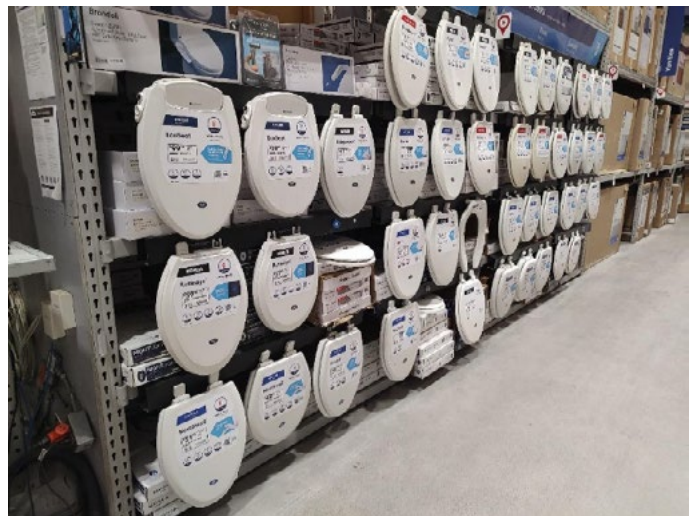
LOCAL HOME IMPROVEMENT STORE SHOWING SOME ROUND AND ELONGATED SEATS